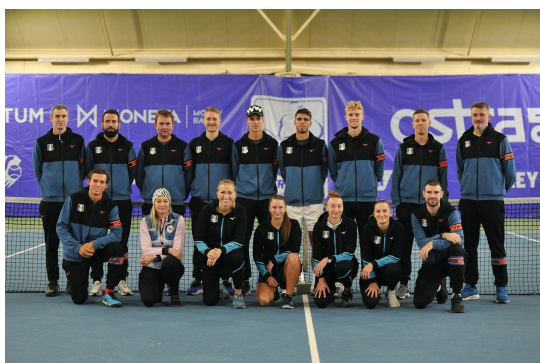
The team of I.ČLTK Praha finished in the third place in the Tenisová extraliga 2023 after winning against TK Most and TJ Spoje Praha. More at www.tenisovaextraliga.cz