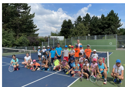
Tennis school organized 7 summer camps for kids