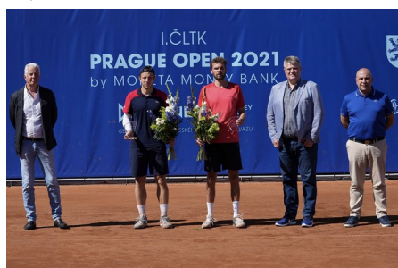
21st ATP Men's Challenger again in combination with ITF women's tournament