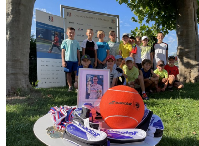
25th series of tournaments for U9 players took place at I.ČLTK

The I.ČLTK Praha committee and all staff members wish all club members Merry Christmas, good health and many successes in 2022.