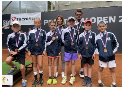
The U9 team fought for the bronze medal in Prostějov