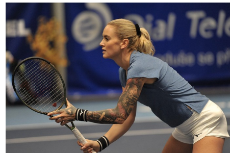
Tereza Martincová and her debut in Top 50 WTA